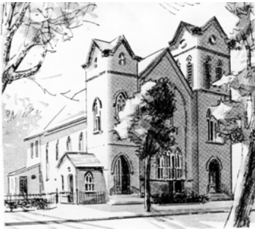
FIRST PRESBYTERIAN CHURCH OF BORDENTOWN 435 FARNSWORTH AVENUE BORDENTOWN, NEW JERSEY 08505